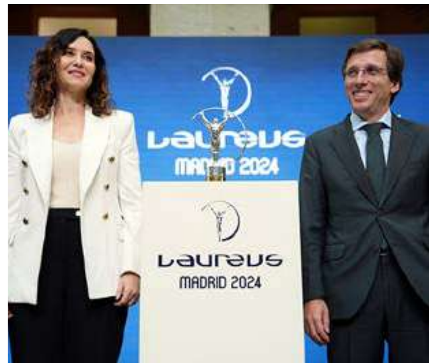
Isabel Díaz Ayuso, President of the Region of Madrid

Bienvenidos a Madrid. Bienvenidos al mejor deporte del mundo. ▲